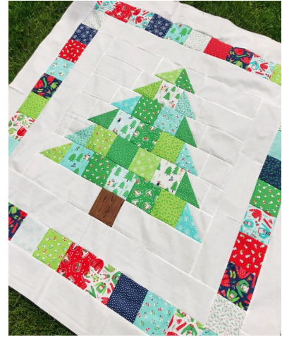
"A quilt is a blanket of love." - Unknown

Christmas Open House Monday, December 8 12:00 p.m. to 2:00 p.m. Coffee & Sweets Viewing & Shopping Visiting & Laughter